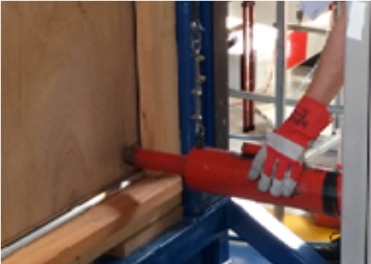
Hard body impact testing as part of PAS24 Enhanced Security conducted at Assa Abloy UKAS laboratory.