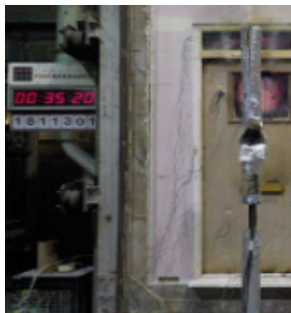
FD30 burn test carried out at Cambridge Fire Research UKAS laboratory. Our tested configuration covers our PAS24 Enhanced Security doorsets with fanlights from both sides.