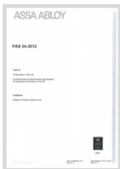
PAS 24 Enhanced Security UKAS Test Report – Timber Doorset

The doorsets manufactured by NFS have been designed and successfully tested to meet the following standards and certifications (where applicable):