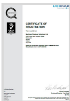
BM TRADA Q-Mark Enhanced Security Door Scheme – Certificate of Registration