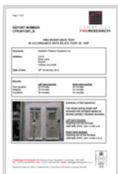
BS476: Part 22 1987 30 minutes Fire Resistant Doorsets (FD30) Dual Aspect