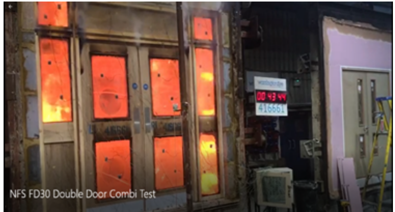
FD30 burn test carried out at Warringtonfire UKAS laboratory. Our tested configuration is far more onerous than tested by our competitors (as shown to the right on the unburned double doors) and pushes the envelope to offer larger glazed and solid options. This sample achieved 43mins 50 secs far exceeding the 30min standard.