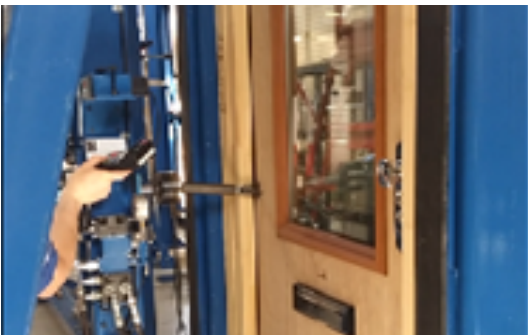
Pressure ram testing as part of PAS24 Enhanced Security conducted at Assa Abloy UKAS laboratory.