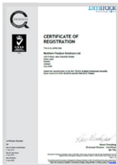
BM TRADA Q-Mark Enhanced Security Door Scheme – Certificate of Registration