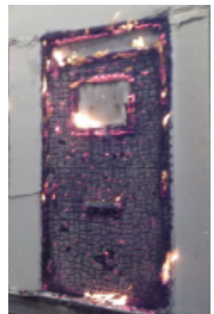
Image shows the same tested PAS24 Enhanced Security doorsets and their proven performance in extreme conditions